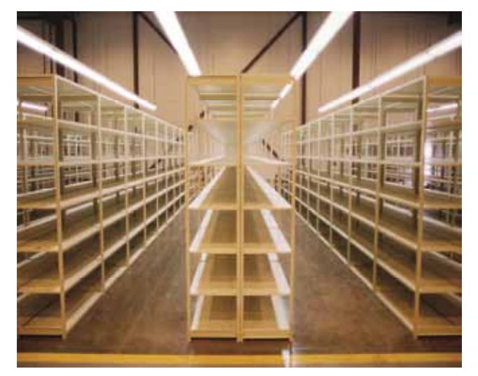
EASYUP 5000 SHELVING